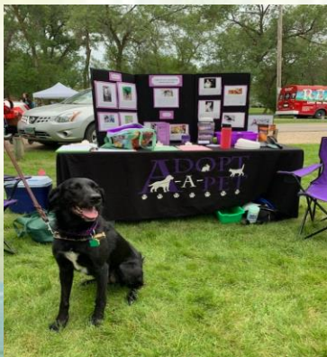
Nite to Unite