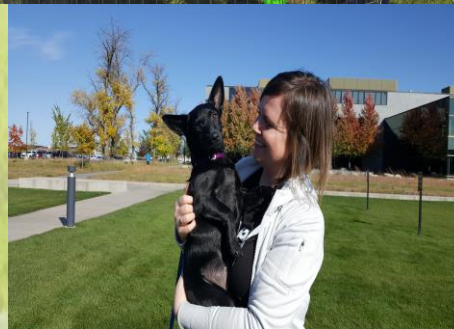
Microsoft Matching Gifts Program